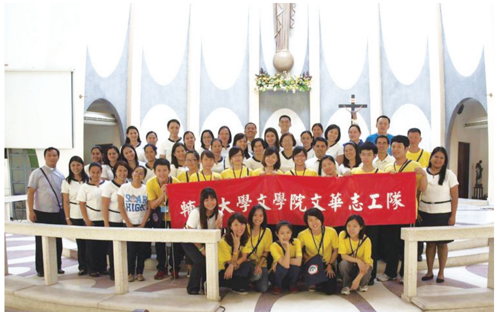
Group photos of Wen-Hua Volunteer Group and local students

The Youth Development Administration (YDA) in the Ministry of Education acknowledged the service work of the Wen-Hua Volunteer Group and conferred its Awards for Volunteer Service and Innovation (服務創新獎) on December 10, 2013. Staff members of the Volunteer Group told a Chinese publication that they will continue to offer quality service for those in need.