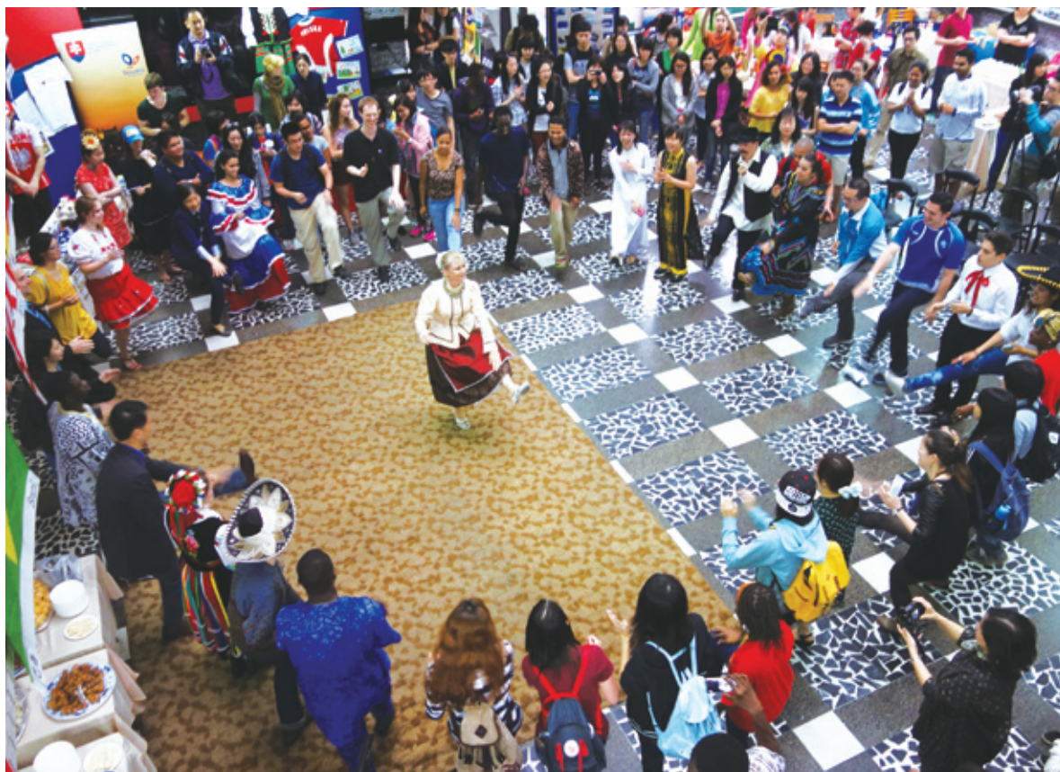
Group photos of International Cultural Exhibition