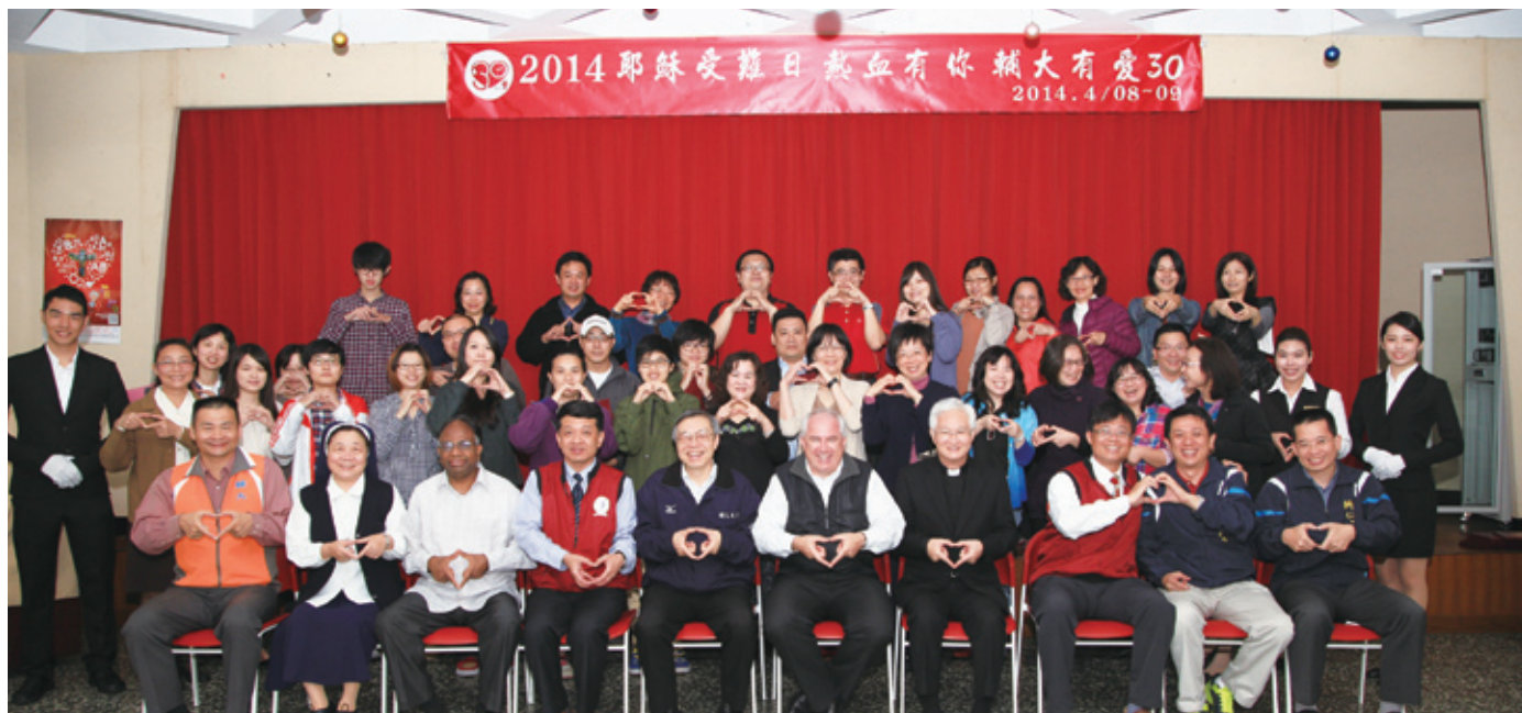
Opening ceremony of the 2014 Fu Jen Blood Donation Drive