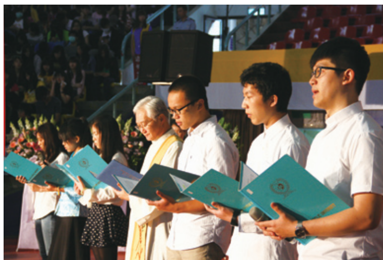
Chaplain and the student representatives