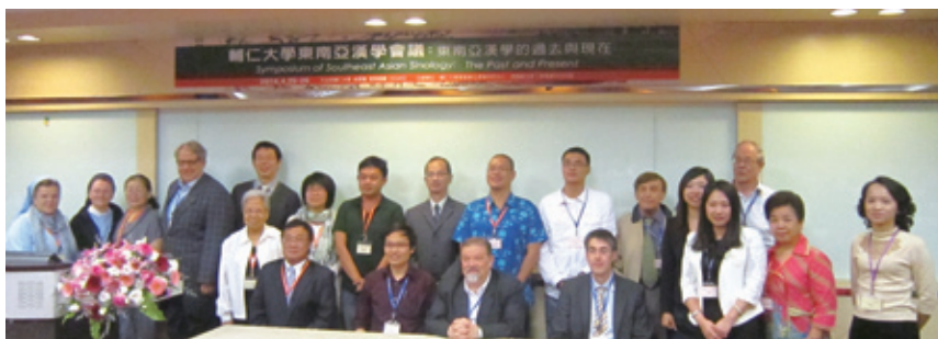
Group photos of scholars at the symposium