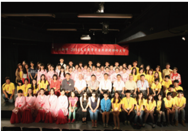
Group photos of the 2014 Poetry Contest