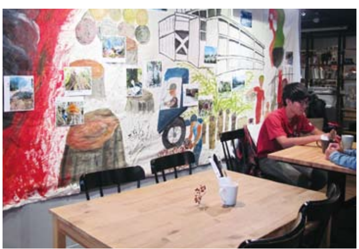
The decoration of the restaurant ING shows its owner's concerns over social problems and different issues.