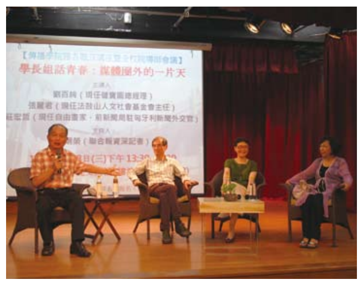
Alumni speaks as honored guest in the Jacob Career Lecture Series

College authorities said to Fu Jen Life that they will continue to maintain and consolidate the unity of Fu Jen's alumni network. Students may solve some of their doubts in the Jacob Career Lecture Series and receive more information about specific fields from these advisers.