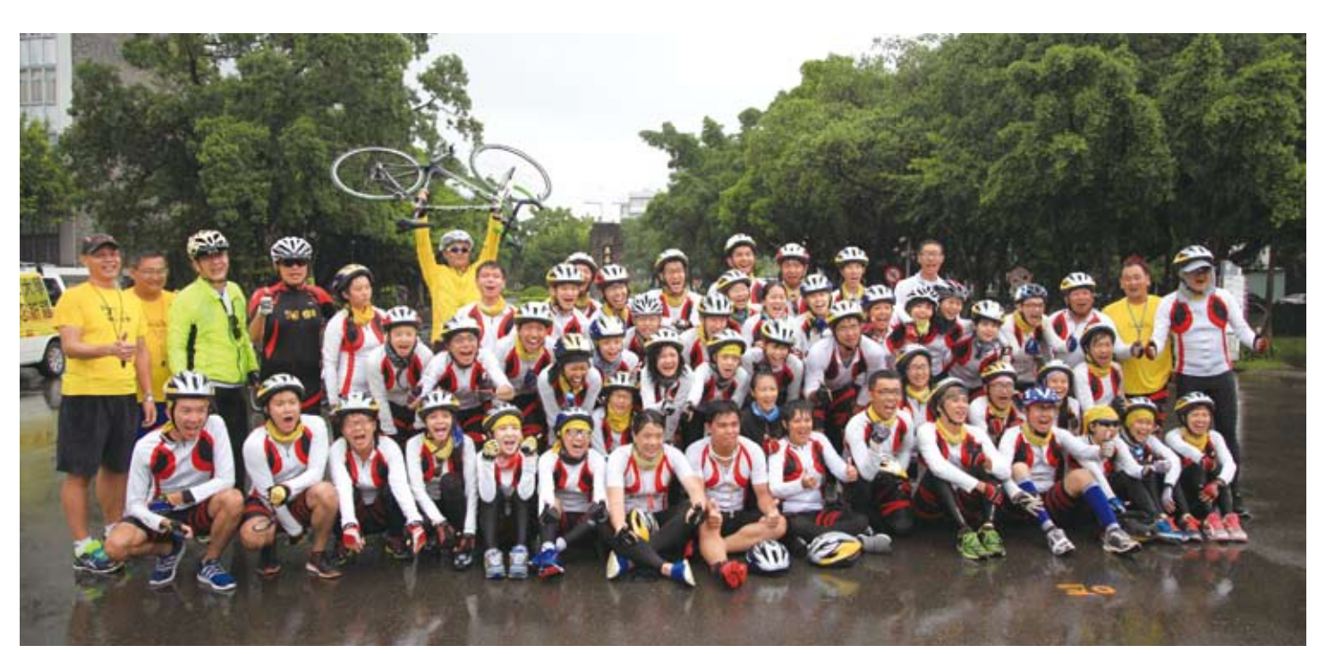
Faculty members and cyclists take group pictures after they accomplish tour.