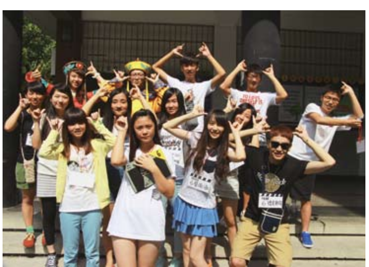
Group pictures of "影-JOY" Student Camp. Staff members prepare various activities for students to better understand the Department of Communication Arts.