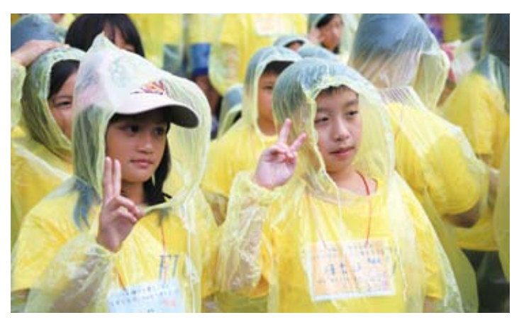
Staff members of the Summer Camp prepare a series of activities for participants and takes group pictures.