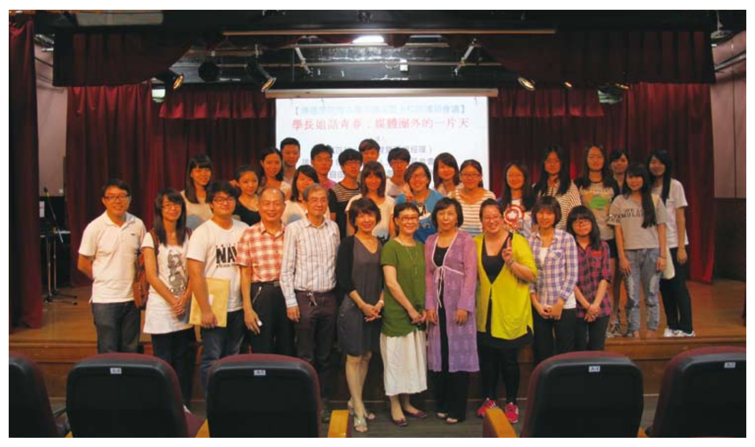
Group pictures of the Jacob Career Lecture Series.